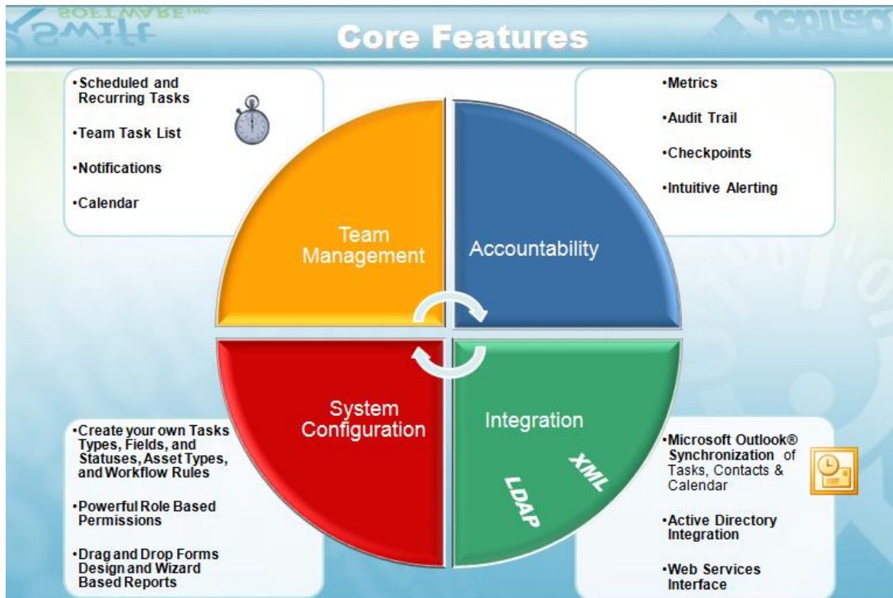
JobTraQ Core Features

JobTraQ ® automates human to human workflow and simplifies hierarchical team management of collaborative tasks. JobTraQ ® automates what data needs to be collected and displayed through each step of a task's workflow and pushes the task to the next step in the process. JobTraQ ® can be rapidly adapted to model your business process frame work using task templates, custom fields, statuses and workflow rules. Also with powerful role based permissions, JobTraQ ® controls task and field level visibility amongst team members, departments and managers. JobTraQ ® allows organizations to gain control and visibility into their tasks.